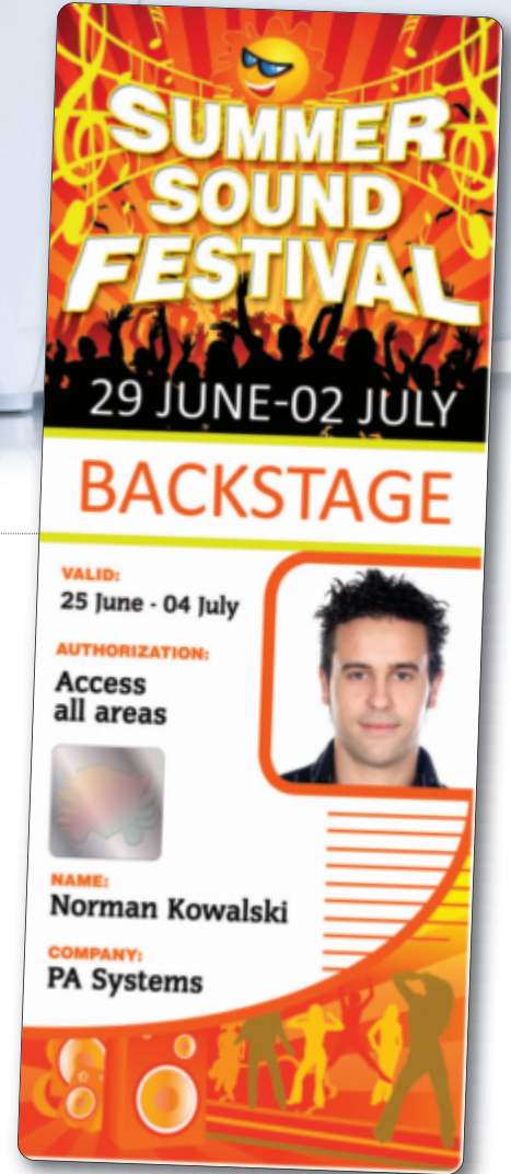
STANDARD CR80 CARD

Magicard's patented HoloKote® security technology adds a watermark to the card as it is printed - it requires no additional consumables and can be customized to an individual logo design - enabling true security at no extra cost.