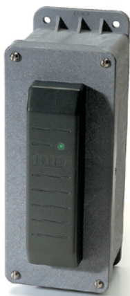
Hazardous Location MiniProx shown with incorporated junction box rated for use in hazardous locations.