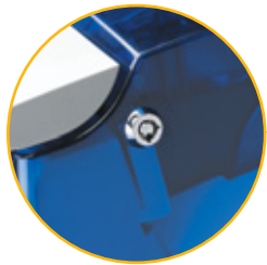
Lock secures ribbons and laminates