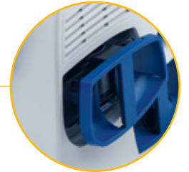
Choose one or two laminators with quick-change cartridges