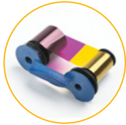
Quick-change ribbons switch out in seconds

The Datacard® SP75 card printer delivers a powerful and unprecedented combination of advanced security and extreme reliability. It is designed to protect critical assets and enhance security in government and corporate environments. Plus, it provides the high-quality output and fast, dependable operation that colleges, universities and other cost-conscious organizations demand from a desktop card printer.