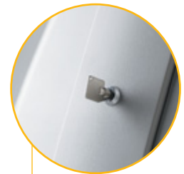
Secure storage of rejected cards