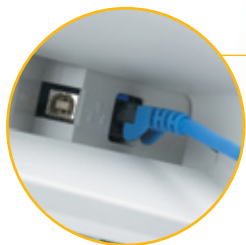
Standard Ethernet port for simple connectivity