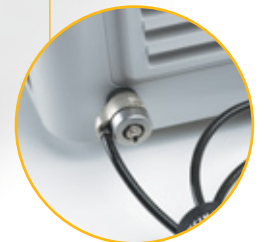
Kensington® lock secures the printer