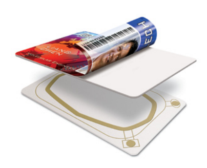
High Definition printing delivers the highest image quality layered on the highest functioning cards. HDP Film fuses to the surface of proximity and smart cards, conforming to ridges and indentations formed by embedded electronics.