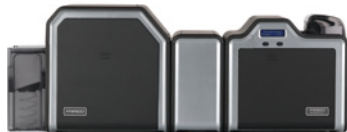
Lamination option and dual-sided printer/encoder

Modular design grows with your needs. Not sure what your ID card applications will require in the future? No problem. The HDP5000 is easily upgraded to fit your needs. Start with a basic single-sided unit. Install encoding modules. Upgrade to dual-sided printing. Add lamination or simultaneous dual-sided lamination for the ultimate in card security and durability.