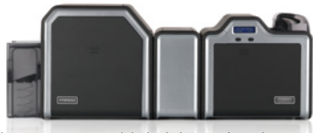
Lamination option and dual-sided printer/encoder