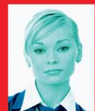
High Resolution Retransfer UV Dye