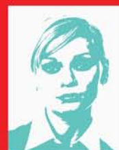
Industry Standard Binary UV Dye

IDWholesaler photo identification for less www.IDWholesaler.com (800) 321-4405