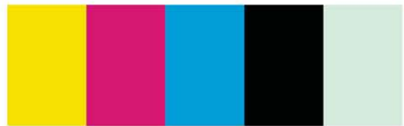
UV Dye on Ribbon Prints on Separate Retransfer Panel

Remember, high resolution gradient UV printing is much more cost-effective than custom holographic laminate, and doesn't require additional hardware. Contact us today to learn more or to request samples!