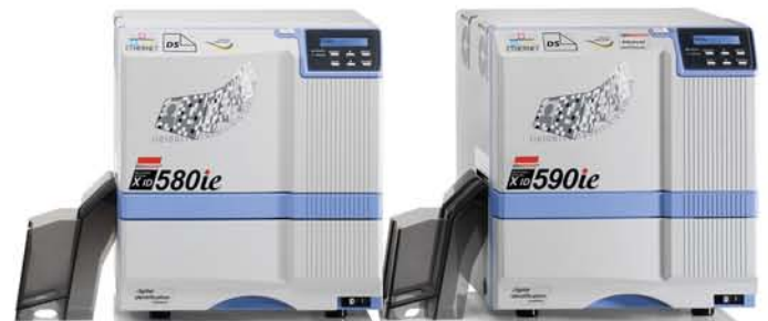
Available for EDISecure ® XID 580ie and 590ie Retransfer Card Printers

IDWholesaler photo identification for less www.IDWholesaler.com (800) 321-4405