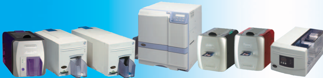
Avalon | Rio | Tango | Prima | Alto | Opera | Sicura

Magocard secure ID card printers include the entry-level Opera and Avalon, the compact Alto, the high-security Rio and Tango models, and the top-of-the-range reverse transfer Prima.