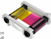
Easy handling, automatic ribbon recognition and setup