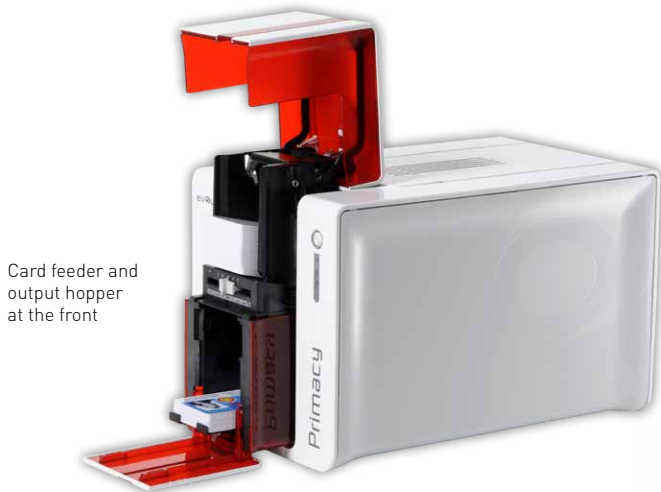
Card feeder and output hopper at the front