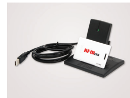
Mounted Desktop Reader