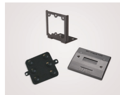
Optional Mounting Brackets