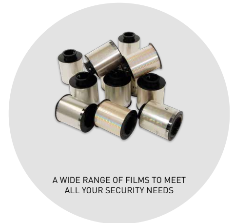
A WIDE RANGE OF FILMS TO MEET ALL YOUR SECURITY NEEDS