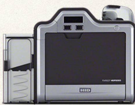
Fargo HDP5000 Card Printer