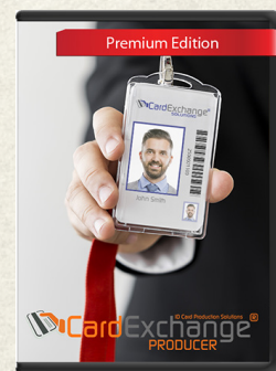
CardExchange ID Software