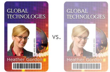
Both cards were placed in direct sunlight for 30 days. The laminated card resists fading.